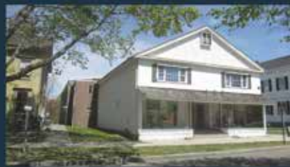
102 Broad Street

Rejuvenation of a gateway building to the Guilford Green